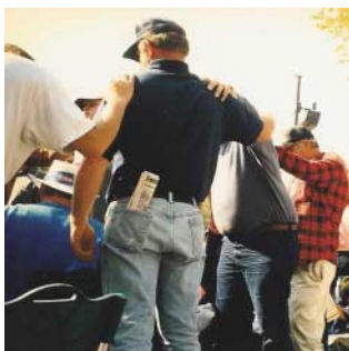
Figure 6. Men focus on their relationship with God through prayer.

The message of the poem is that just because you are not sick or ill, does not mean you are healthy or well. Sometimes people can be much closer to illness than they realize. Unfortunately, it has been the tendency of many people to be concerned about health only when they get sick. We need to start putting more of our energy into striving for