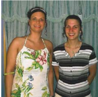
Figure 5. Friends share a great relationship with each other.

is really healthy or well, one could say things are going very, very good – often at the best possible level. Another way to look at this is that when you are well, you are functioning at the level God has planned for you. The poem to the right compares and contrasts the state of “not being sick” with the state of “being well” for each part of the whole person.