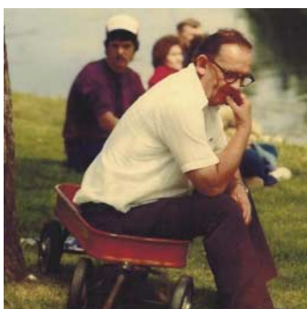
Figure 4. Grandfather thinks about various life events.