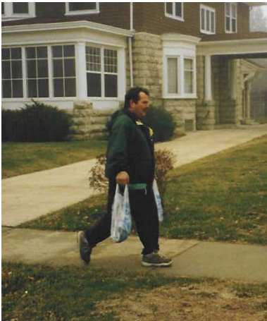
Figure 7. This man is taking responsibility for getting more exercise by choosing to walk and not drive to and from the grocery store.

little or no control over. Despite this reality, we do have a responsibility to make the best of situations we are presented with. We must also remember we are to help our family, friends, and neighbors with their health. While many of us are not health professionals, there are many things we can do to help. In some situations it is the person who is not the health professional who is best suited to do what needs to be done. What happens when we fail in this responsibility for ourselves and others? First of all, we are to recognize it and then realize failure is part of being human. Next, we are to ask forgiveness from God, others, and even ourselves. Forgiveness is not to be taken for granted, but to be viewed