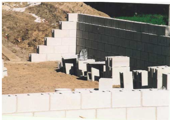
Fig. 1. As important as this foundation is to its home, so are your health beliefs important to the state of your personal health.

Figure 3. This person had a high blood cholesterol and her body was affected by blockages developing in the arteries of her heart. “My Thoughts and Feelings,” as shown by the grandfather deep in thought in Figure 4, is the psychological part of your whole person. This part is involved with thinking